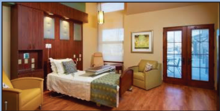
Representative image of patient suite in a Hospice House

SECU Hospice House in Franklin will become the only free-standing inpatient hospice facility in North Carolina west of Asheville.